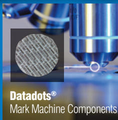
Datadots® Mark Machine Components