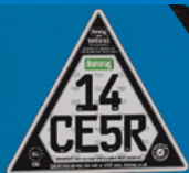
Unique Tamper-Evident Identification Label