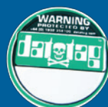
Transponder Self Adhesive Tag