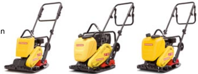
Weight class - 100 kg (220 lbs)

A high-capacity asphalt plate. Dynapac's unique water distribution system* gives an optimal result on asphalt. Excellent manoeuvrability. Petrol and diesel versions available.