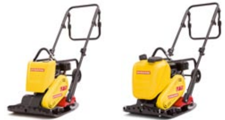
Weight class - 75 kg (165 lbs)

A superior asphalt plate! Dynapac's special bottom plate is designed not to leave any marks on the asphalt. 20% faster than previous models – for increased output. 2 bottom plates available: 420 or 500 mm.