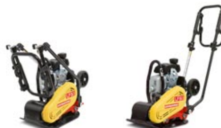
Weight class - 50 kg (110 lbs)

Small contractors' favourite! Ideal for narrow trenches and small soil jobs. Fast and manoeuvrable. Compact and easy to store.