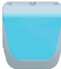
Contact surface in blue.

The bottom plate is the most critical component of a forward plate for asphalt compaction. The new LF series has a unique design of the bottom plate and its edges give a well-defined contact surface to avoid marks on the surface. This is only one example of how you'll benefit from Dynapac's long-earned experience and continuous research.