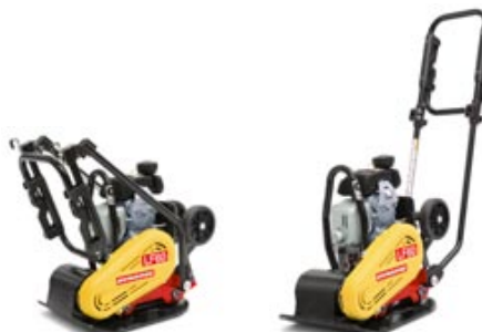
Weight class - 60 kg (132 lbs)

The basic soil plate compactor for narrow trenches and small soil jobs. Fast and very easy to manoeuvre with its tight turning radius. The foldable handle provides for easy transportation.