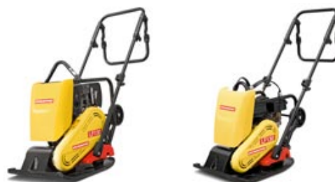
Weight class - 130 kg (286 lbs)

The multi-purpose plate. Designed for heavy-duty soil applications. Highest compaction performance in the Dynapac range. Petrol or diesel versions.