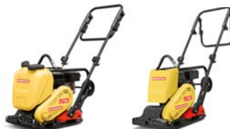
Weight class - 80 kg (176 lbs)

Soil and asphalt version in one! Just add the clip-on water tank to operate on asphalt. High productivity is a hallmark for the fastest model in our forward plate range. Optional retractable wheels make it easy to move the LF80 around.